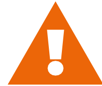
Pedestrian and driver alert