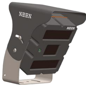
IRIS 860 sensor

SEEN's IRIS 860 sensor detects reflective tape on high-vis PPE and markers, enabling simple and effective active detection, with virtually zero operational impact and no on-going cost. See how at www.seensafety.com